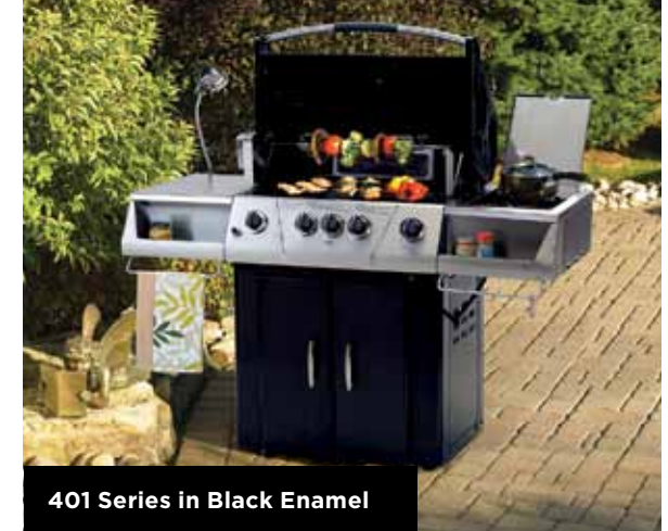
401 Series in Black Enamel