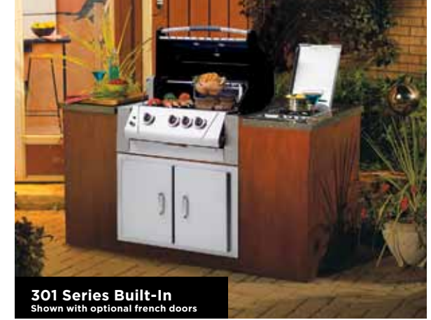
301 Series Built-In Shown with optional french doors

*Based on 2010 mid-size grill category, 300 Series.