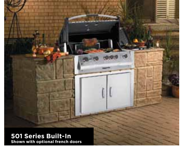
501 Series Built-In Shown with optional french doors